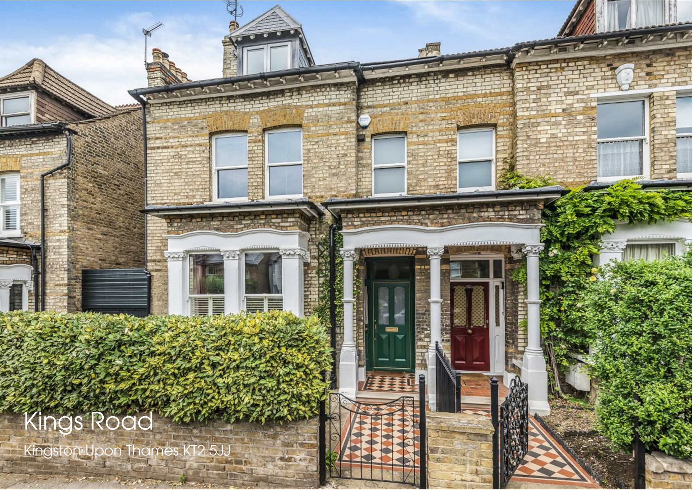
Kings Road Kingston Upon Thames KT2 5JJ